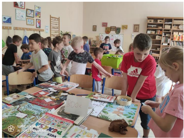
SHOT ON MI NOTE 10 AI PENTA CAMERA