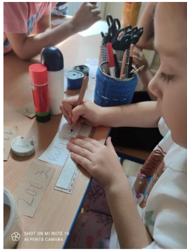
SHOT ON MI NOTE 10 AI PENTA CAMERA