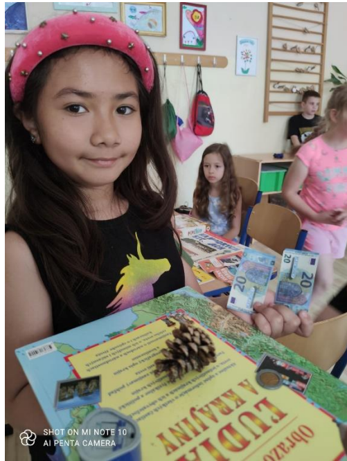
SHOT ON MI NOTE 10 AI PENTA CAMERA