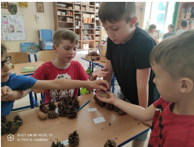
SHOT ON MI NOTE 10 AI PENTA CAMERA