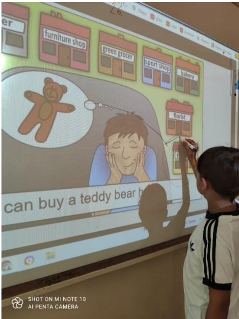
SHOT ON MI NOTE 10 AI PENTA CAMERA