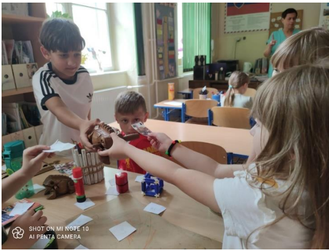
SHOT ON MI NOTE 10 AI PENTA CAMERA